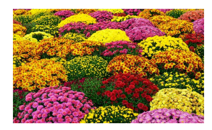
Help Decorate the Sanctuary for Fall

The worship committee would like to decorate the sanctuary this Fall with mums. We are asking for your support. The 9x6" potted mums are $10 each.