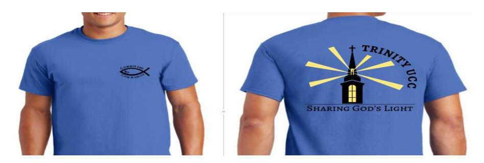
TRINITY T-SHIRT ORDERS

We are taking orders for our newly designed t-shirts!